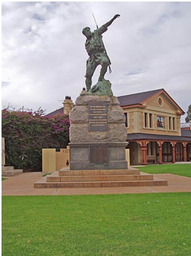
Broken Hill War Memorial World War 1 Cenotaph