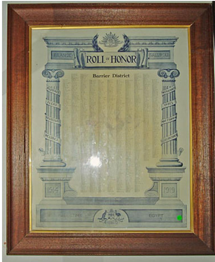
Barrier District Roll of Honour