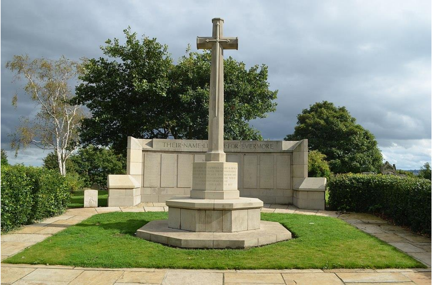
Cross of Sacrifice & Screen Wall